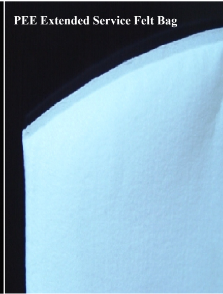
PEE Extended Service Felt Bag