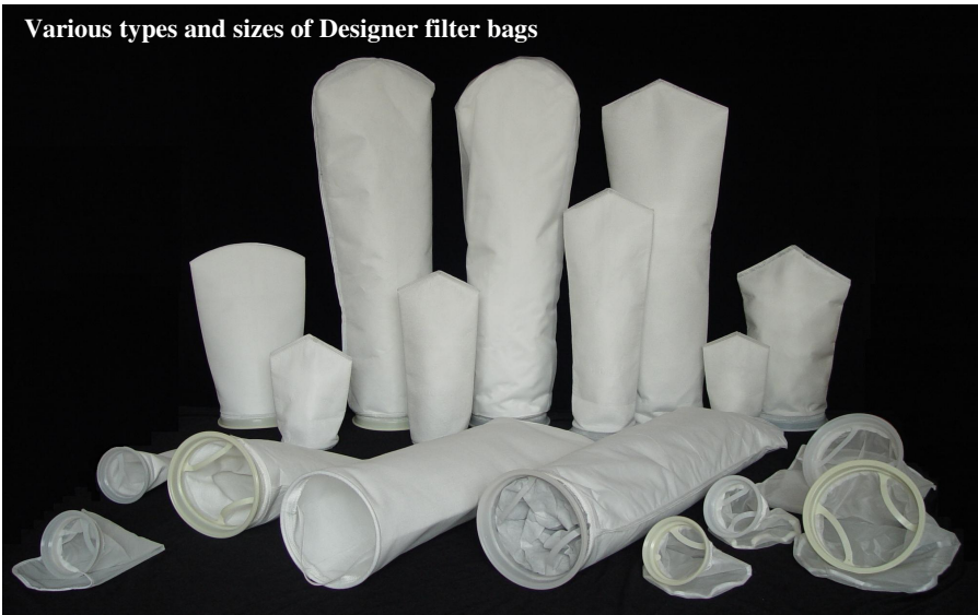
Various types and sizes of Designer filter bags

The Designer filter bags are SCC signature specialties, featuring “Three Heights” - HIGH degree of individualization, HIGH technical content and HIGH added value.